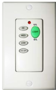
WC-5-WH Wall Control Included